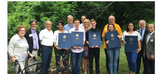
2018 Education Award Winners with Leaders